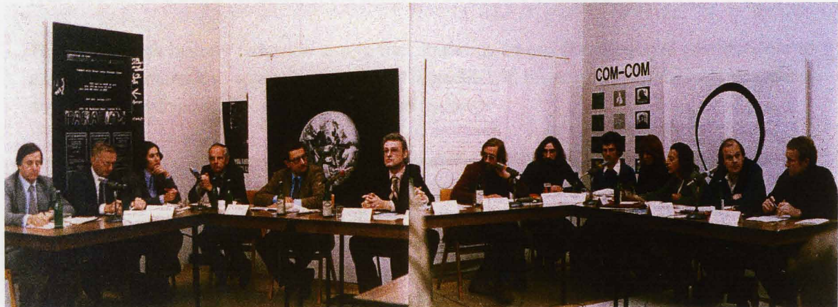
"Kunst als Soziale Strategie" (Art as Social Strategy), 1977, Bonn Kunstverein. Podium discussion between German government ministers and APG artists. UK artists make proposal to ministers to adopt artists in their governmental departments as done in the UK.