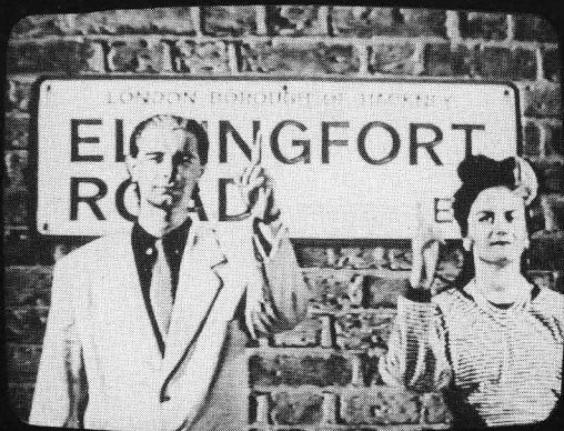
'Walk the street...' HEARTBEAT