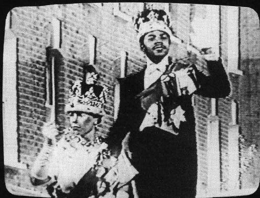
'Its my heartbeat' HEARTBEAT