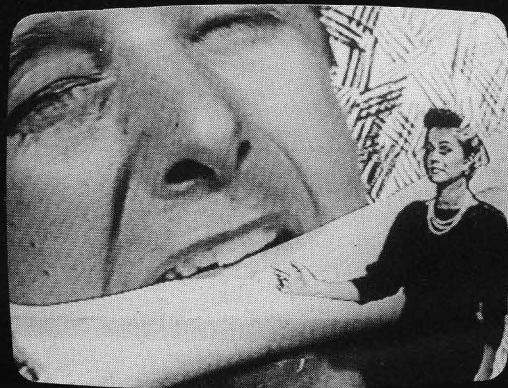
'Is Britain really a country of barbarians?' COMMENT