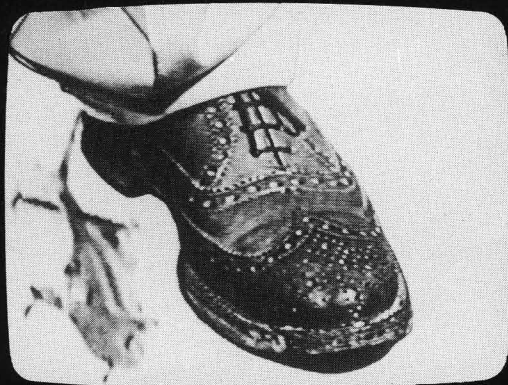
'Hear the beat...' HEARTBEAT