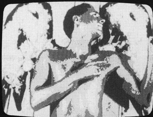
'It was heaven, it was paradise...' TRUE LIFE ROMANCE