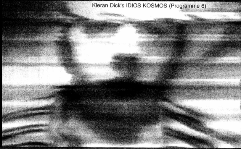
Kieran Dick's IDIOS KOSMOS (Programme 6)

All presentations in this series are FREE, non-ticketed events, and are held (unless otherwise noted) in the Henry White Kinnear Education Theatre, located on the lower level of the Art Gallery of Ontario, 317 Dundas St. West (please use Main Entrance to the Gallery).