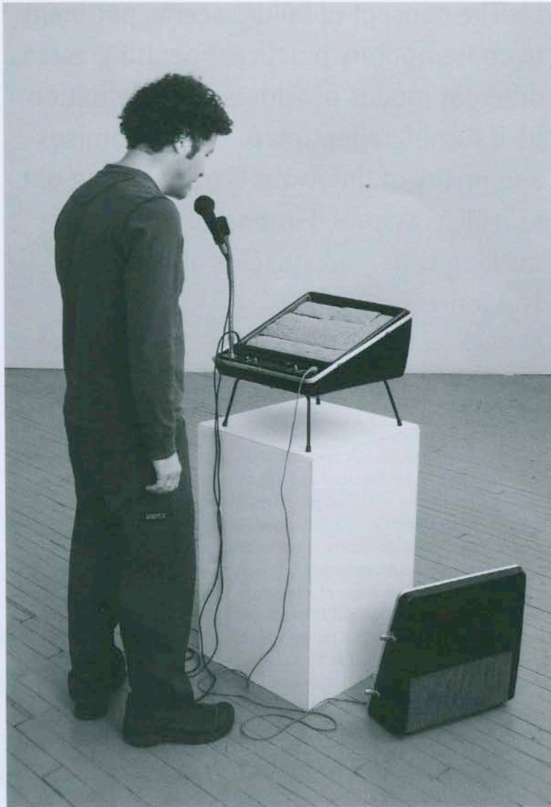
Paul Ramirez-Jonas Broadside 2007

realities embodied by Concorde are juxtaposed against a background of survival street commerce, new and old cars, public transport, noise, decaying historic and modern buildings, smog, dirt and people going about their daily lives. In Broadside , 2007, Ramirez-Jonas uses the quintessential symbol of the author – the typewriter. But these machines type on to thick slabs of wet clay, turning the process into something dirty, messy and fragile, since the brittle nature of the unfired clay will result in it cracking and breaking. Presented on a portable lectern, the slabs stand awaiting public reading, and are inevitably damaged in some way by transportation. Rather than producing original texts, Ramirez-Jonas transcribes existing passages; this activity is reminiscent of the ultimate occupation of Gustave Flaubert's characters from his 1881 novel Bouvard and Pécuchet . Following the inheritance of a fortune, a pair of copy clerks, François Denys Bartholomée Bouvard and Juste Romain Cyrille Pécuchet, set out to increase their knowledge. Taking up residence in the countryside, armed with an expanding library, they try their hand at experiments that include farming, medicine, museology, love, garden design, distilling alcohol – each one costing more than it