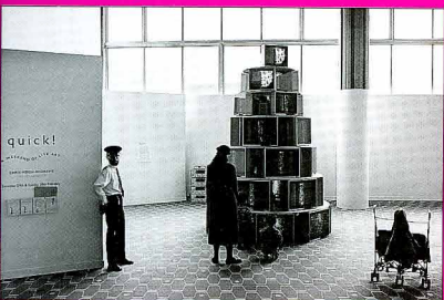
'Eau d'artifice' Royal Albert Hall South Bank, London. April 1993