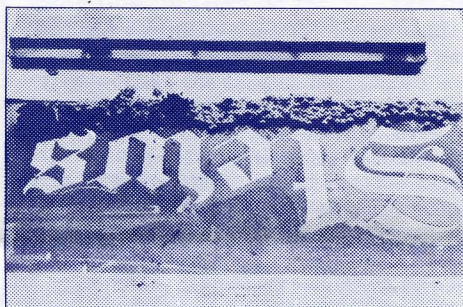
"Stews" about to be pulled

Ruscha has experimented with graphics, and in 1970 made screenprints using, instead of inks, foodstuffs such as baked beans, chocolates, etc.