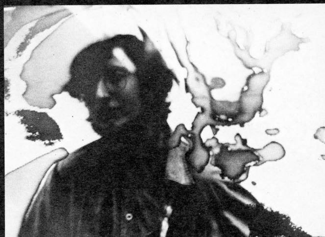
Videvent 1973-1975 (installation views and stills)