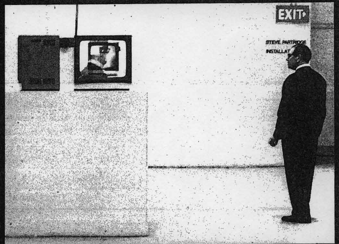
Installation No. 1 1976, shown at Third Eye Gallery, Glasgow (March 1976)

Everything about the nature of \frac{1}{2} -inch video seems to make it ideally suited to individuality and creativity. Artists are able to use video equipment either completely alone or in small groups. No specialized professional skills are needed to operate the equipment, and tape costs far less than film. All of this seems to make video a truly human-sized medium.