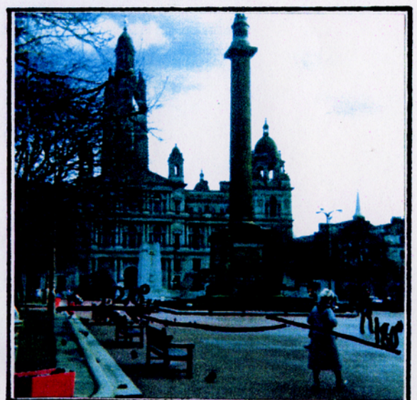
CAMERA COVERAGE AREA.