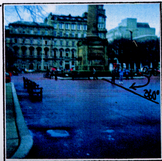
CAMERA COVERAGE AREA.