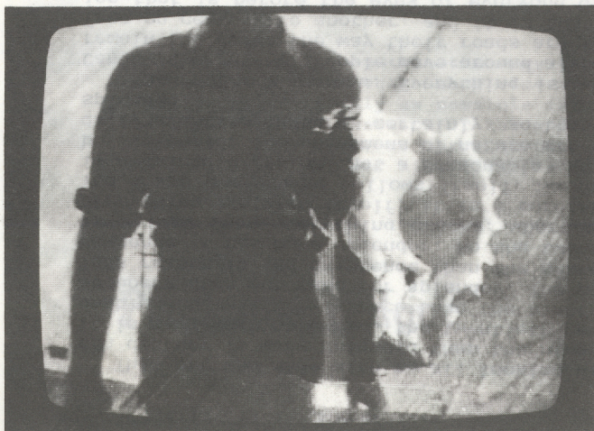
THE VENUS TAPE.

Now available on ACG Video Artists on Tour (£25)